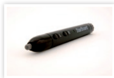
Electronic pen (optional)