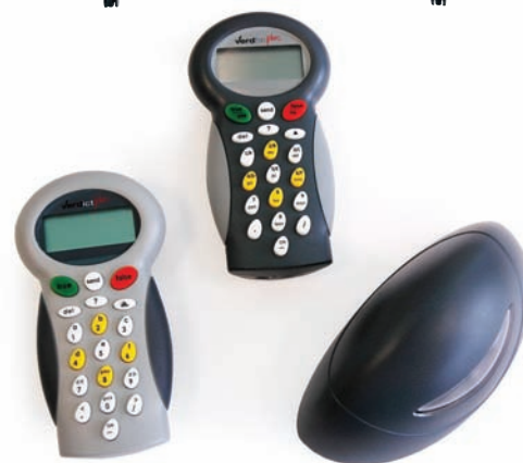
Verdict handsets with receiver